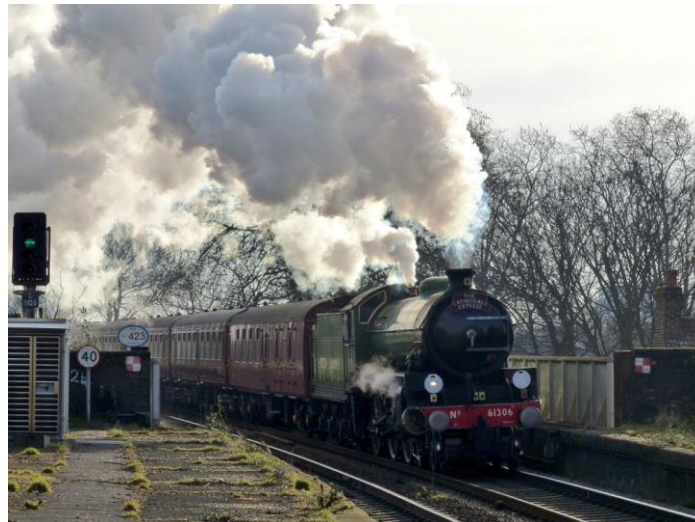
61306 Mayflower with the Cathedrals Express at Wanstead Park on 07.03.2015