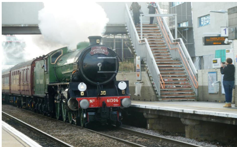
61306 Mayflower at Blackhorse Road with the 7 th March 2015 Cathedrals Express railtour to Bath & Bristol

The long suffering passengers waiting on station platforms between Barking and Gospel Oak for their half-hourly train service this Saturday may be forgiven for thinking that a steam train had come to their rescue!