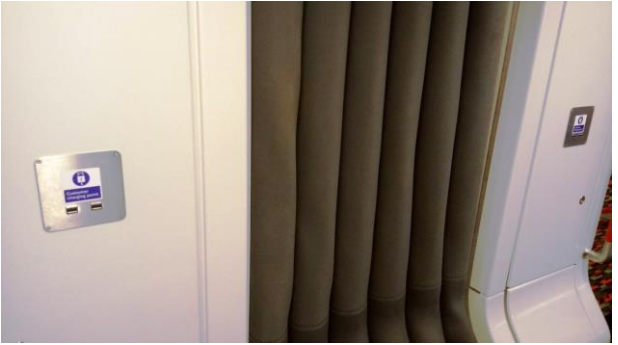
USB charging points at the inter vehicle gangways [Modern Railways]