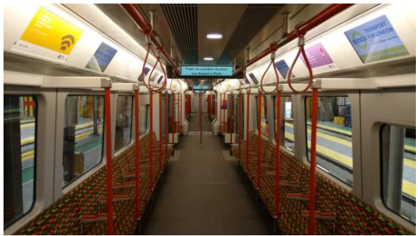
Interior of 710 261at Willesden with new seat moquette design on 20<sup>th</sup> June