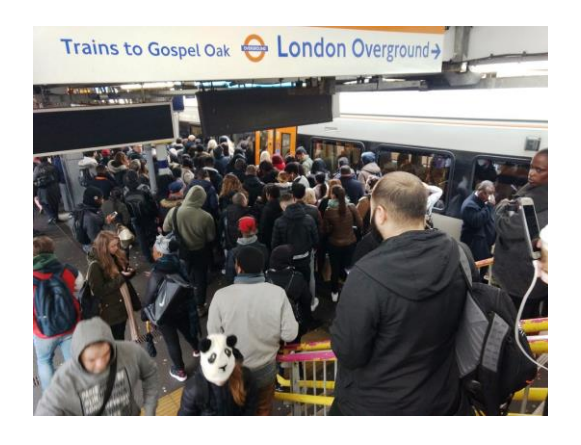
Morning peak at Barking 12/03/2018

The TfL website still states that the Barking – Gospel Oak timetable is "still in production and will be published soon."