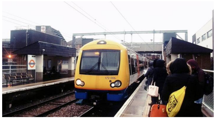
07:59 SSuX Woodgrange Park to Willesden Junction Low Level calls at Blackhorse Road on 15/02/2018 [@CMPD C]]