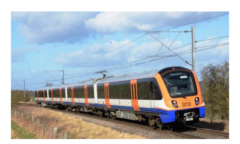
710256 on test at NR's Leicestershire test track on 15/02/2018

It is now hoped that Class 710 will receive type approval soon, allowing deliveries to London Overground to start, in turn allowing NR route approvals to be obtained and driver training to start with a view to the trains entering service in September this year.