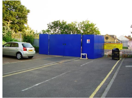
The Exeter Road entrance

Walthamstow Queen’s Road station was closed off by construction site hoarding within hours of the last train departing.