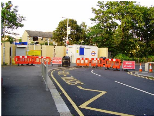
The Edinburgh Road entrance

The prolonged closure is for Network Rail to install overhead wires to allow electric trains to operate over what is the last diesel only passenger railway line in north east London. Ten bridges over the railway need adapting or rebuilding, while the line itself has to be lowered in four locations to provide the necessary clearances for the 25,000 volts AC overhead cables. The most difficult job will be lowering track and platforms at Walthamstow Queen’s Road station by as much as 50cm 2 .