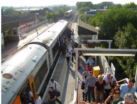
A westbound train departs Blackhorse Road for South Tottenham, while the train nearest the camera is about leave for Walthamstow Queen’s Road and Barking on 4 August 2013

For regular Barking – Gospel Oak commuters, Mr. Wallis said, “If at all possible, passengers from east of South Tottenham should look for alternative routes during the Victoria Line closure. The North London Line from Stratford now has mostly 5-car trains so offers a possible alternative.”