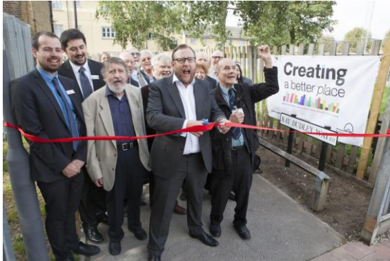
Official opening on 26 th September 2014