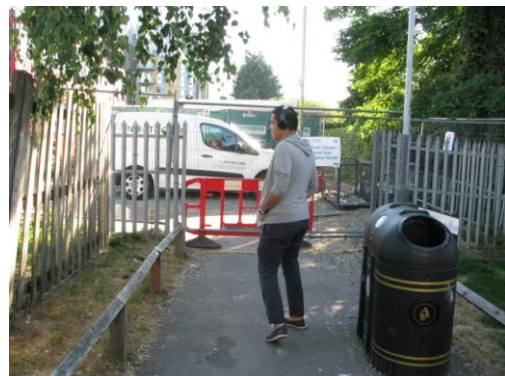
8 th August 2015