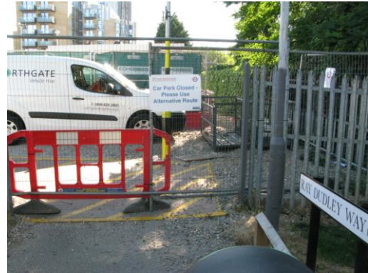
8 th August 2015