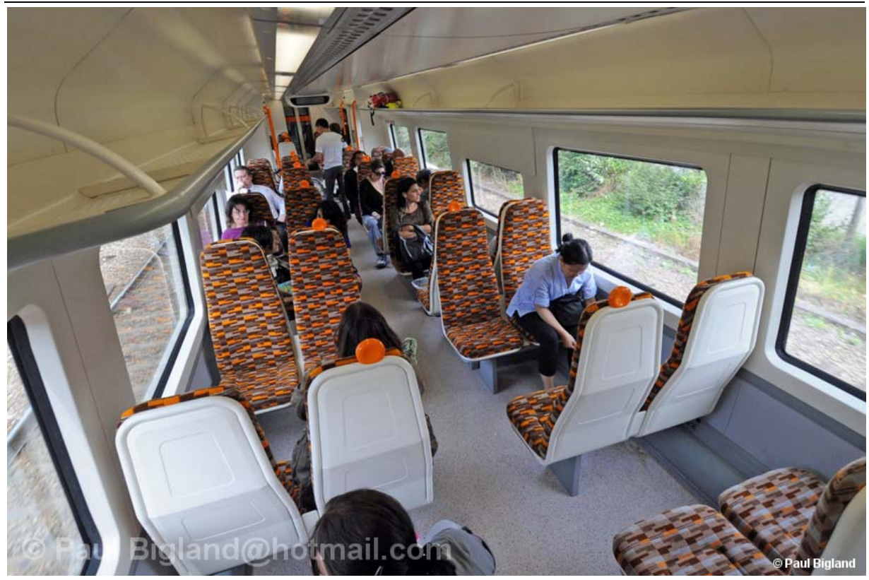
DG58629: Passengers get to try out 172004 on the first day the class has been in public service 17th July 2010

Arriving a year late from the factory, London Overground operator gets new trains into service fast!