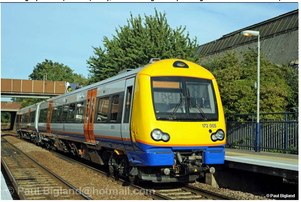
DG58897: 172005 calls at Blackhorse Rd on its first day in service. 19th July 2010

Arriving a year late from the factory, London Overground operator gets new trains into service fast!