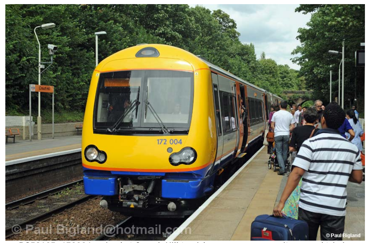
DG58625: 172004 arrived at Crouch Hill to pick up passengers on its second trip in revenue earning service. 17th July 2010